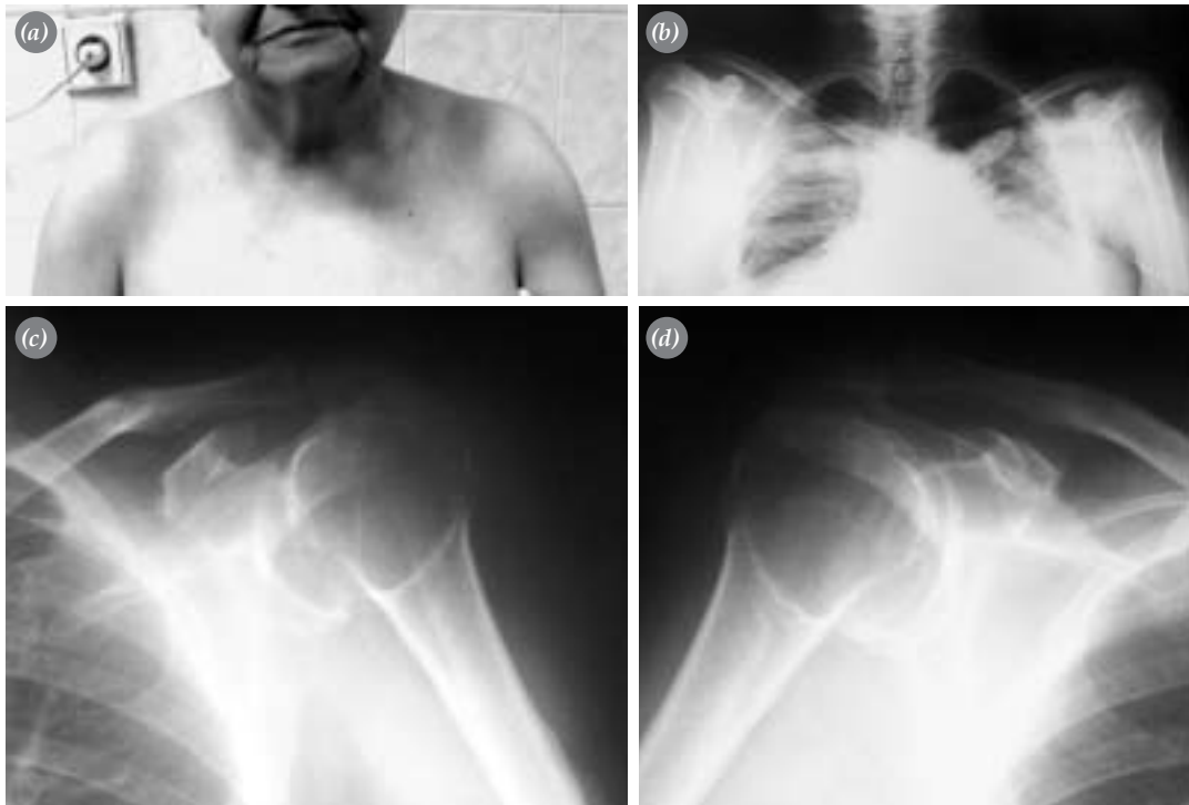
Figure 2. (a) View of the patient with bilateral shoulder dislocation before reduction, (b): x-ray obtained before reduction. X-rays of the left (c) and right (d) shoulder after reduction (Case 2).

completely at the end of sixth month. At the end of 1.5 years follow-up there were any instability or strength loss detected.