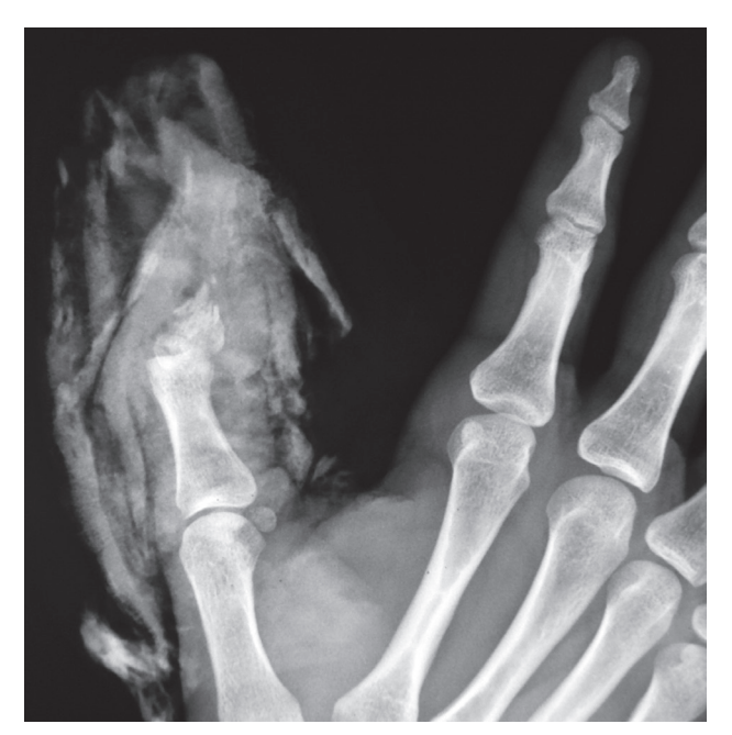
Fig. 1. Loss of the distal phalanx.

Although there may be different procedure options for thumb reconstructions, replantation is always the first choice because it results in the best functionality with an almost-normal appearance, as reported by many authors.<sup>[4–6]</sup> However, when replantation is not appropriate or if replantation attempts fail, many alternative procedures can be considered depending on the ampu-