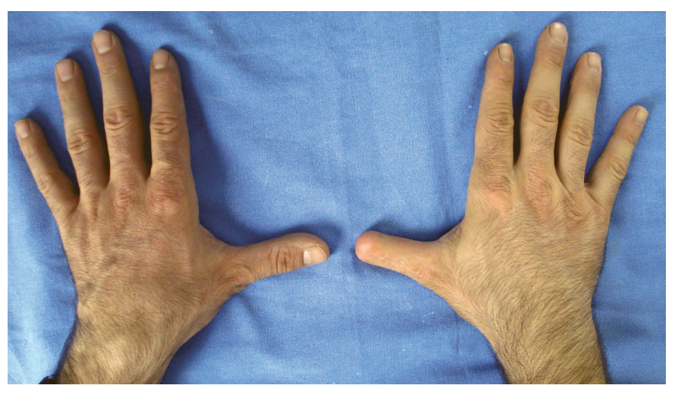
Fig. 4. Improved absolute deepening of the first web space, which was achieved by the distraction. [Color figure can be viewed in the online issue, which is available at www.aott.org.tr]

or proximal transfer of the adductor pollicis brevis) may be required to alleviate this problem. Salom et al reported that they had performed deepening procedures for the first web in all cases and additional proximal transfers for the adductor pollicis brevis in 2 cases in their series of 6 patients who underwent first metacarpal lengthening.<sup>[19]</sup> Finsen and Russwurm have treated 9 patients with first metacarpal lengthening after traumatic thumb amputations.<sup>[20]</sup> In 6 of these patients, the proximal transfer of the adductor pollicis brevis and deepening of the first web were performed as an additional treatment.